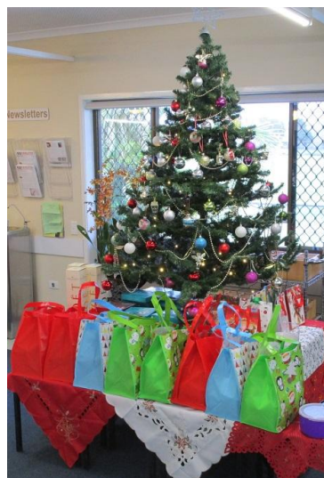
Our Christmas Tree with lots of prizes